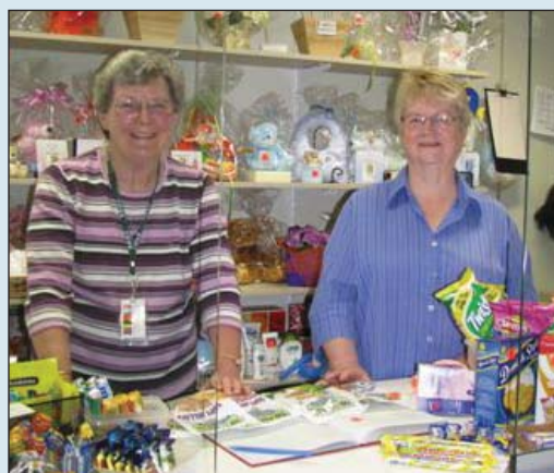
Kiosk Auxiliary Volunteers