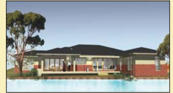
Toonalook Waters Home for auction