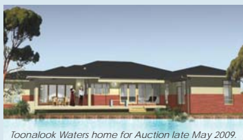
Toonalook Waters home for Auction late May 2009.