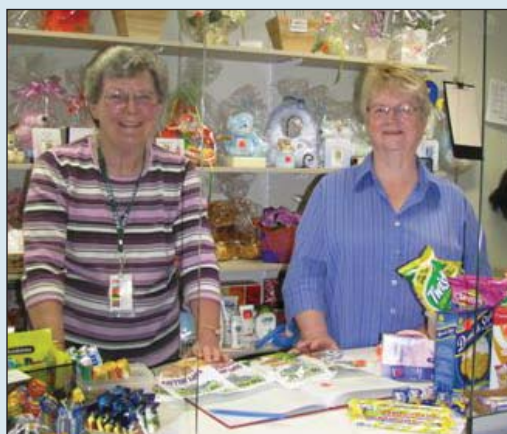
Kiosk Auxiliary Volunteers