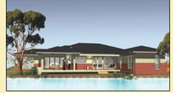
Toonalook Waters Home for auction